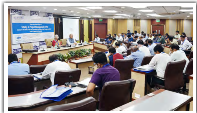
Participants of the TPM workshop leading to ISO/IEC 17024:2012 accredited Certificate In Project Management (CIPM) credentials